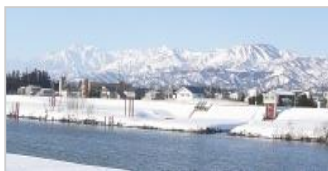
Joetsu City during the winter season