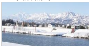
Joetsu City during the winter season