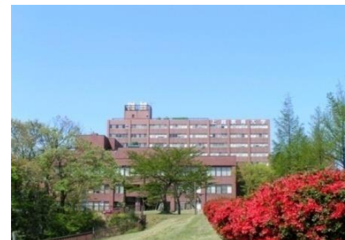
[The Front View of Joetsu University of Education]

• To provide curriculums with a cooperation of an academic advisor, considering each student's interests.