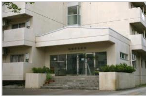
[ Outside view of International Dormitory ]

Full kitchen, unit bathroom, toilet, hot water supply facilities, heating and cooling air conditioner, 2 single beds, desk with drawers, swivel chair, bookcase, reception table and chair, dining table and chair, cupboard, wardrobe, entrance cabinet, washing machine, dryer, refrigerator, desk lamp and closet.