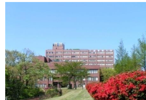
[The Front View of Joetsu University of Education]

• To provide curriculums with a cooperation of an academic advisor, considering each student's interests.