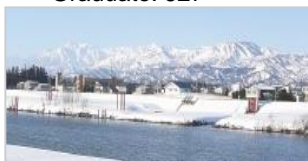
Joetsu City during the winter season