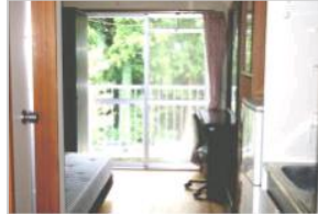
[ Inside view of Single room ]