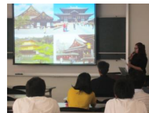
Student achievement short presentation

We provide information to all students after completion, with foreign student networks and monthly news letters.