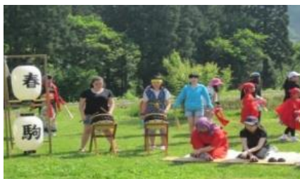
Cultural Experience with community

• Overseas students, registered as special auditors, can attend the classes with Japanese students and acquire course credits after fulfilling certain requirements.