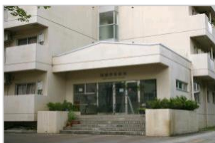
[ Outside view of International Dormitory]

Full kitchen, unit bathroom, toilet, hot water supply facilities, heating and cooling air conditioner, 2 single beds, desk with drawers, swivel chair, bookcase, reception table and chair, dining table and chair, cupboard, wardrobe, entrance cabinet, washing machine, dryer, refrigerator, desk lamp and closet.