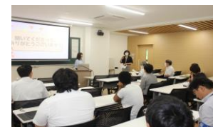
[ Presentation of Research Result ]

Although it varies depending on their academic supervisor, students will generally receive thesis guidance from their supervisor once a week, lectures on approximately 4 subjects per week (including supplementary Japanese language classes), and practice at school approximately two days per week. At the time of completion, students will be required to present the results of one year research under the guidance of their academic advisor and Japanese language instructors, and submit a completion report (approximately 30 pages).