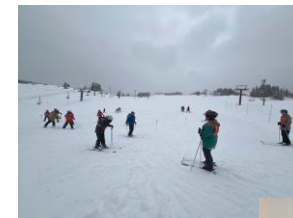
[ Ski Experience ]