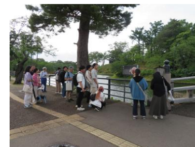
[ Joetsu History and Culture Study Program ]