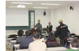
[ Presentation of Research Result ]

Although it varies depending on their academic supervisor, students will generally receive thesis guidance from their supervisor once a week, lectures on approximately 4 subjects per week (including supplementary Japanese language classes), and practice at school approximately two days per week. At the time of completion, students will be required to present the results of one year research under the guidance of their academic advisor and Japanese language instructors, and submit a completion report (approximately 30 pages).