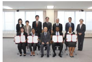
[ Teacher Training Student Completion Ceremony ]