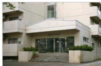
[ International House ]